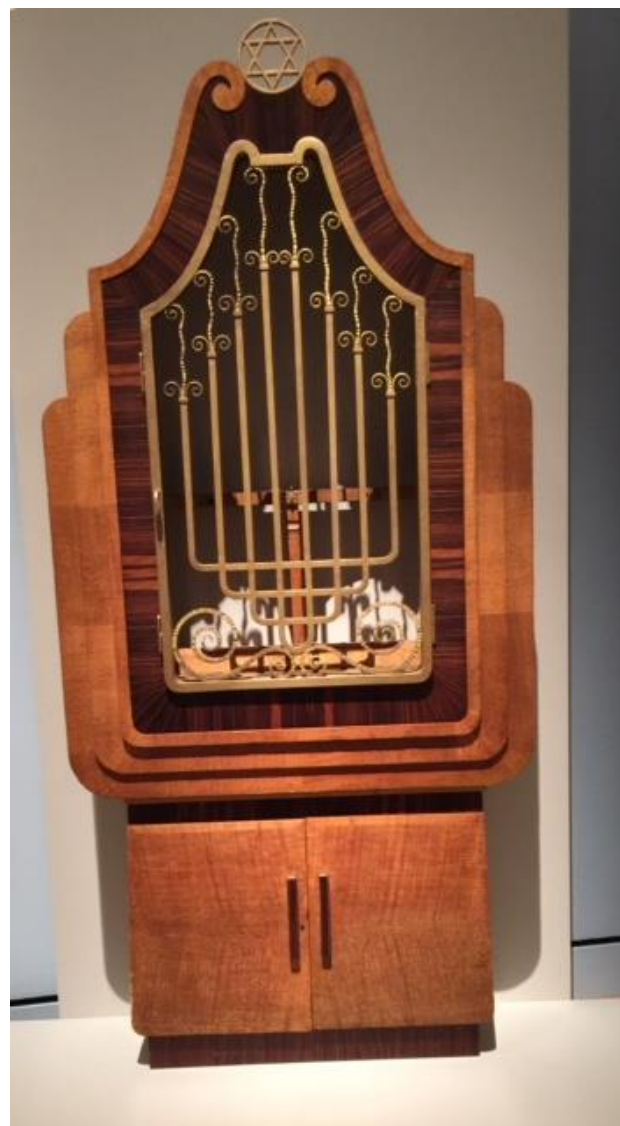
EXHIBIT AT PEABODY SALEM MUSEUM

Among Sephardic communities, Chanukah lights are lit in the synagogue before Havdalah and at home, Havdalah precedes the lighting.